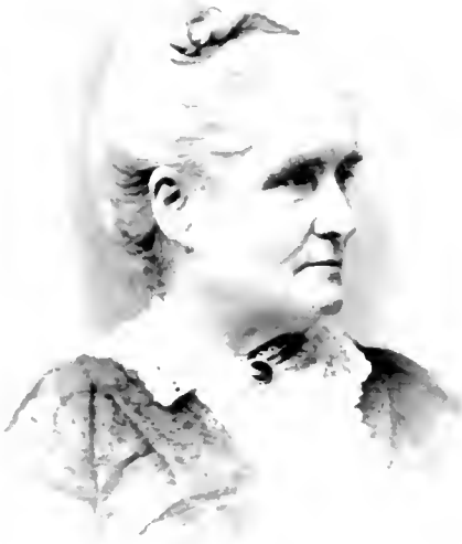
HARRIET HANSON ROBINSON.

for some years on the Tremont Corporation. Her early years were full of toil, but she studied and educated herself, and showed literary talent in her girlhood. In 1848 she became the wife of William S. Robinson, at that time the editor of the Boston "Daily Whig," and afterwards famous as "Warrington" in the Springfield "Republican" and in the New York "Tribune." He was for eleven years clerk of the Massachusetts House of Representatives. He died 11th March, 1876. Their family consisted of four children. Three of them are still living, and two of them, daughters, are mentioned elsewhere in this book. Mrs. Robinson's first attempt at writing for the press was made while she was yet an operative in the Lowell mills. Her verses appeared in the newspapers and annuals of the time, and in the "Lowell Offering," that unique factory girls' magazine. During her early married life she was too deeply engaged in helping a reformer-journalist to earn